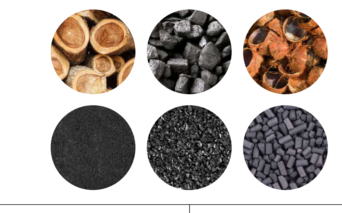
Our steam activated carbon comes from wood, coal and primarily coconut shells. Its final form can be as powder, granulate or pellets.

Most of our carbon is produced in our Indonesian factories from naturally grown coconut shells. These are not only superior for adsorption of pollutants due to their extremely high porosity, but also by far the eco-friendliest raw material for activated carbon.